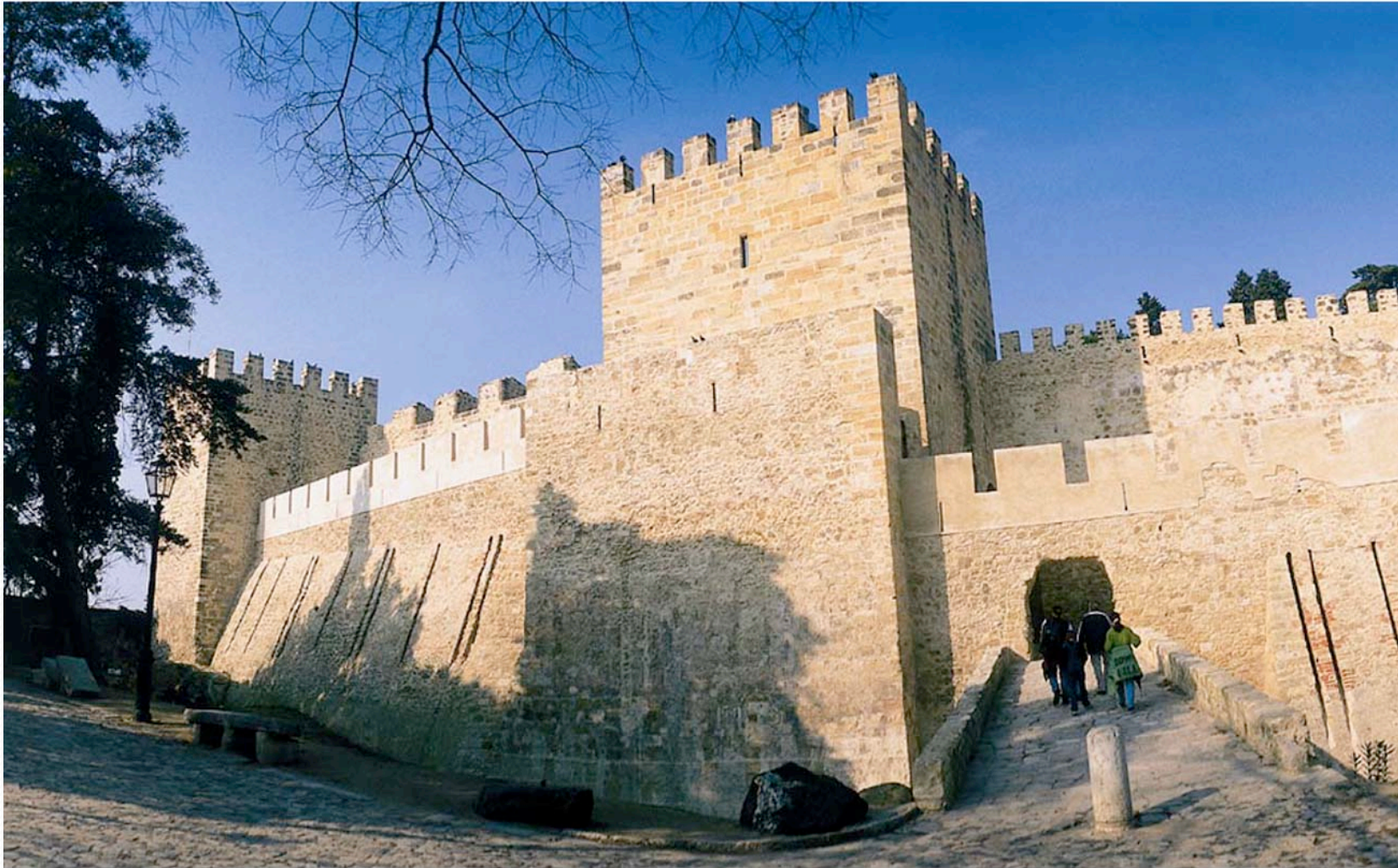
Castle of São Jorge: 1 million visitors/year