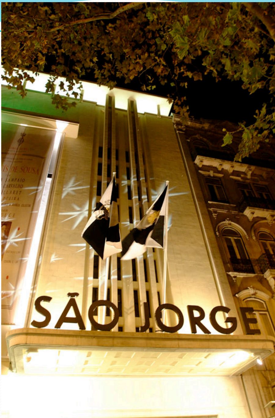
Cinema - São Jorge