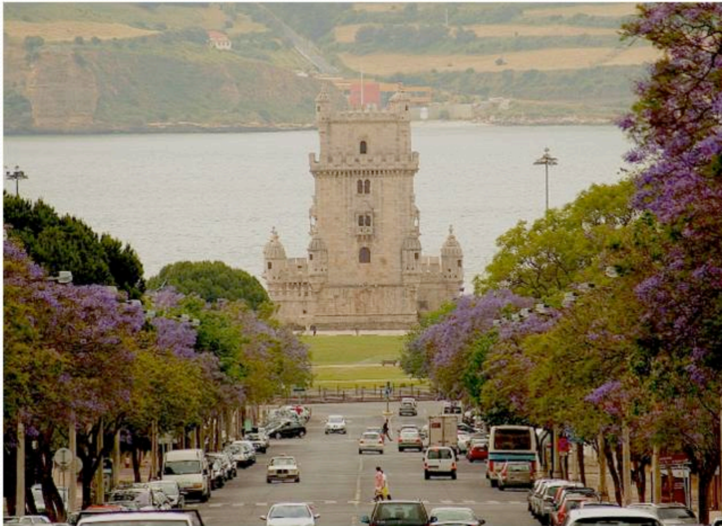
Image of the Belém Tower