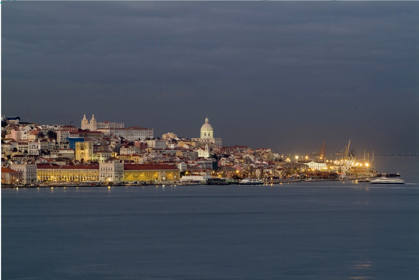
View of the river and the city