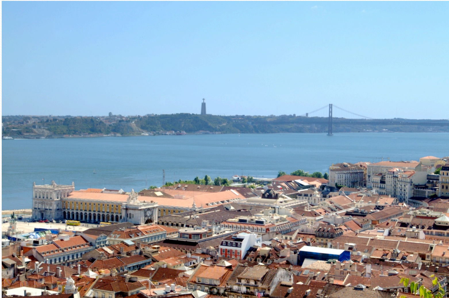
View of the river and the city